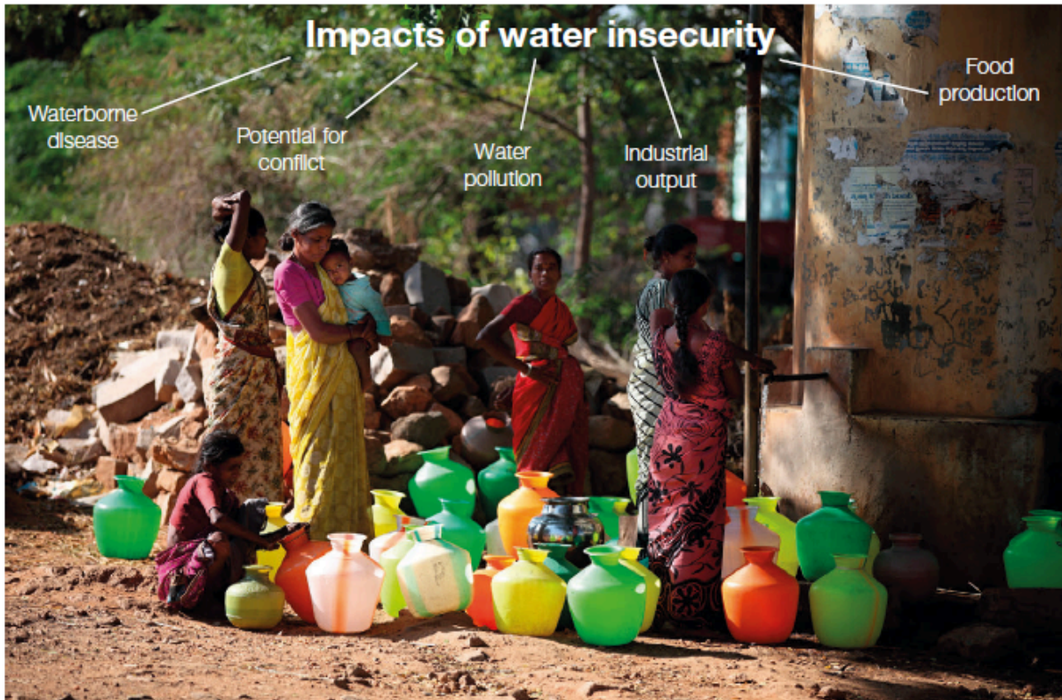
Figure 2- some of the impacts of water insecurity.

You can use the prompt words on the image to help you select the impacts you want to explain, but make sure you explain how they are the result of water insecurity.