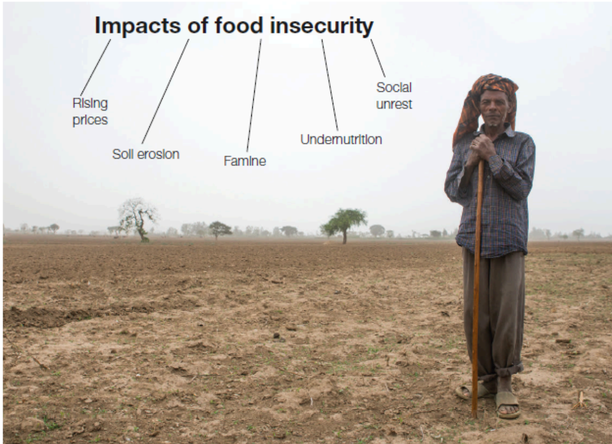
Figure 1- some of the impacts of food insecurity.

You can use the prompt words on the image to help you select the impacts you want to explain, but make sure you explain how they are the result of food insecurity.